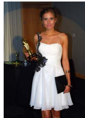
Best Dressed Female