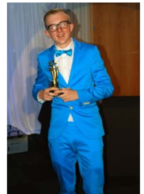
Best Dressed Male