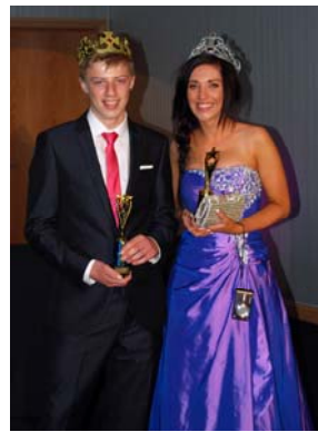
Prom King and Queen